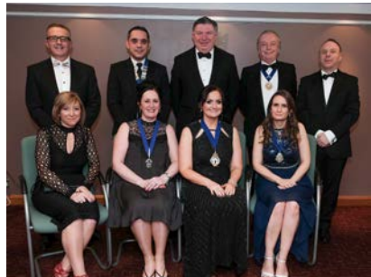
The President, Senior Vice President and guests at the Annual Dinner