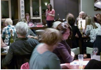
TVLS Quiz Night held in aid of Teenage Cancer Trust