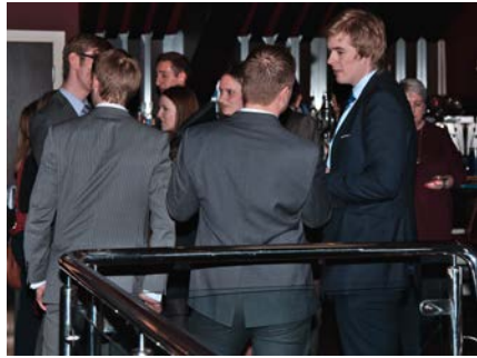
Junior lawyers at the Tees Valley JLD launch event

they have ahead. I would also like to thank all of those who have helped me throughout the year including our committee, administrator and Tilly Bailey & Irvine LLP who have provided me with endless support.