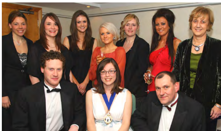
The President and some of the guests

I was humbled at the turnout for our Annual Dinner. All firms have had to tighten their belts over the last few years so to see so many of you out in force at the Dinner was incredible. Over 300 guests enjoyed the dinner which was, once again, supported by Northumbrian Water