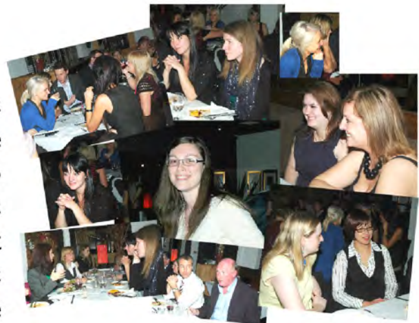
The Launch of The Tees Valley Law Society Awards

At this informal event which was attended by a cross-section of the profession, from a young man who had completed the LPC and was hoping to secure a training contract to some more established members of the profession, I launched the inaugural Tees Valley Law Society Awards.